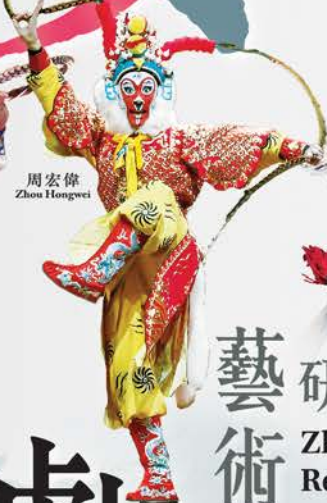
周宏偉 Zhou Hongwei